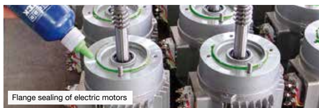
Flange sealing of electric motors

A vibration and impact resistant adhesive bond is created after curing, which is resistant to chemicals, solvents and temperatures of -60°C to +200°C (-76°F to 392°F).