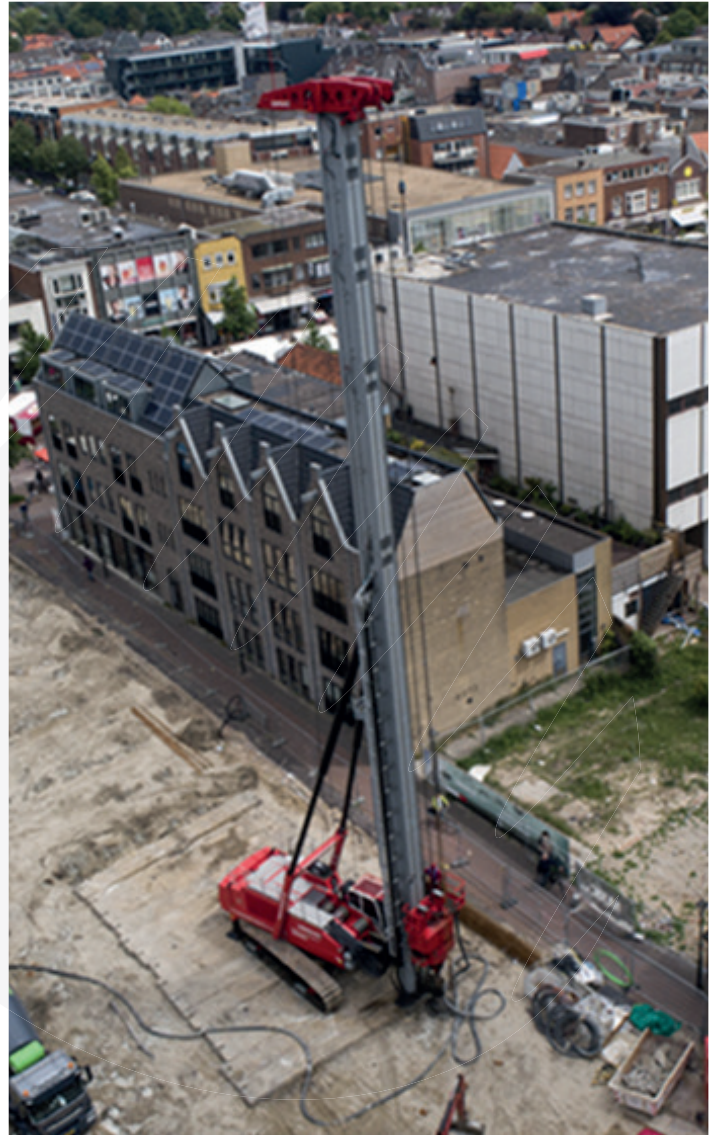
Fastening bolts in piling and drilling rig extension couplers.