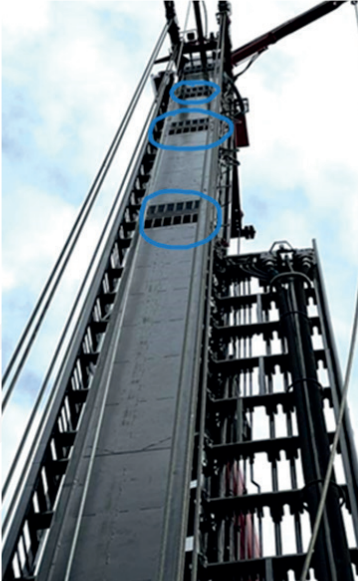
3 extension couplers marked in blue.