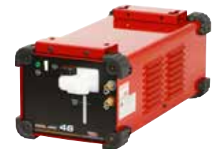
COOLARC® 46 K14105-1